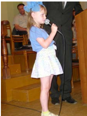
Girl recites poetry