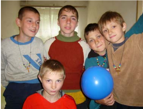
12 year old boys