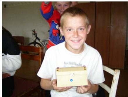
Proud of his treasure box