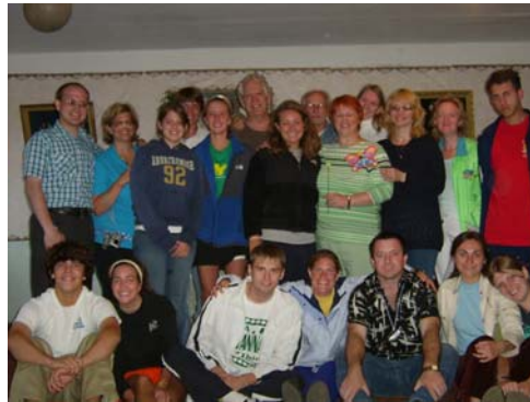
Our combined Russian American team