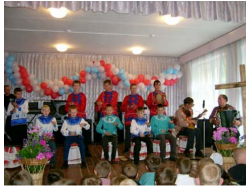
Orphan folk ensemble