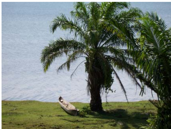
Typical sight on the Atlantic coast of Nicaragua