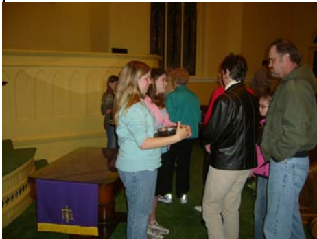
L Youth at Sandersville impose ashes and serve communion at Ash Wednesday Service