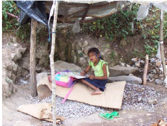
A young girl takes some time from "work" to study.